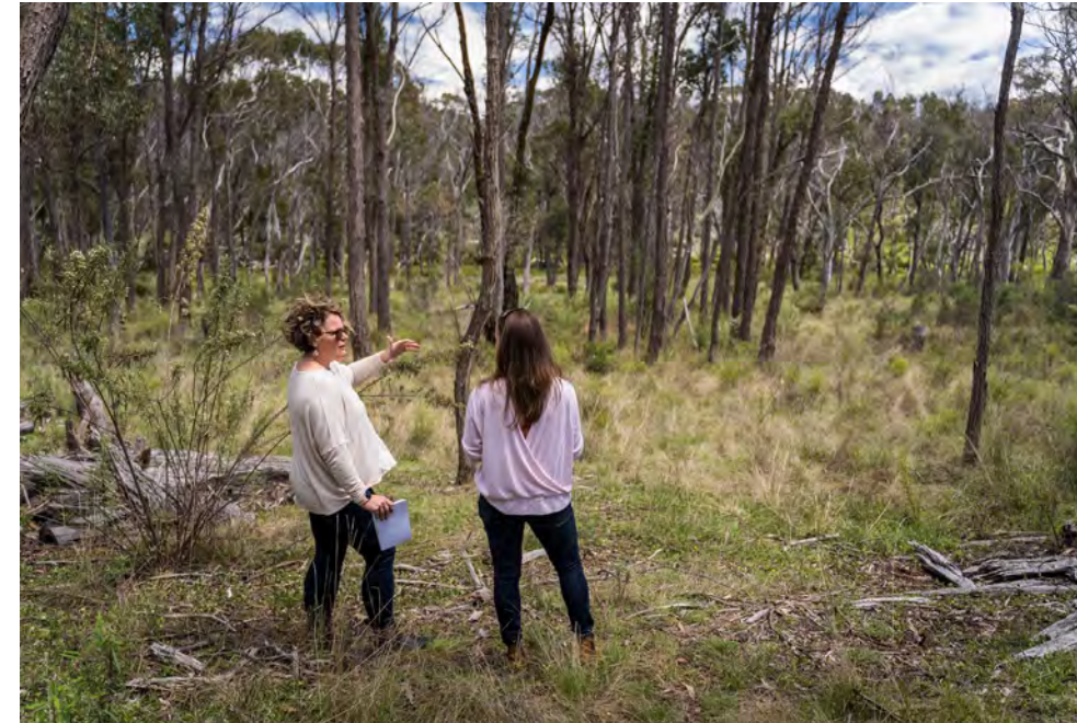
Planning a passive off-grid home with a client

customers can experience, review and share their home design with stakeholders, friends and family before finalising construction documentation. At Epic Architecture, we make the design process collaborative, fun and immersive.