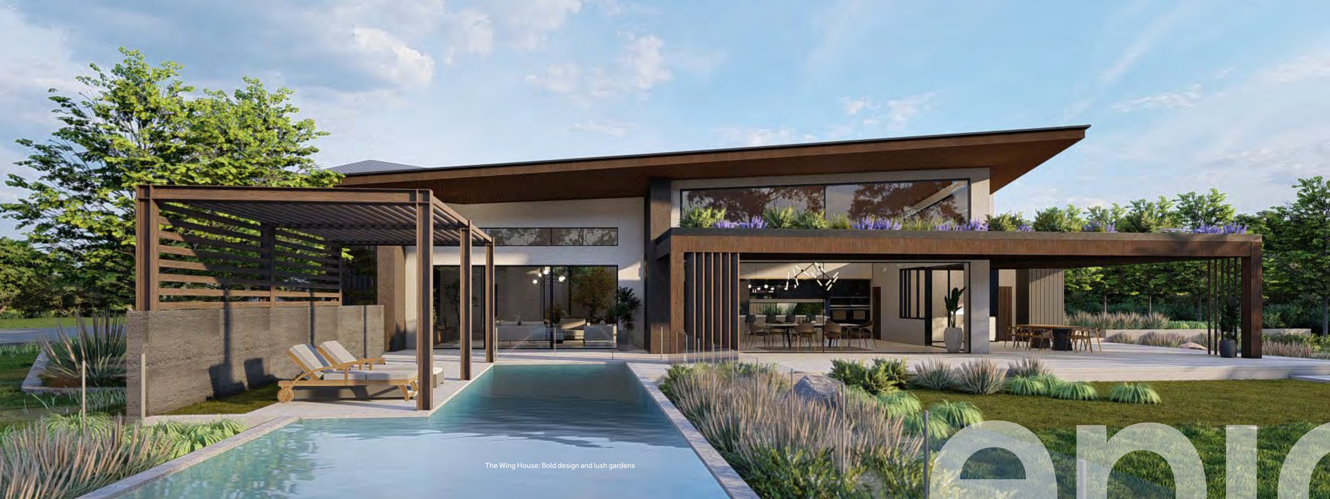
The Wing House: Bold design and lush gardens